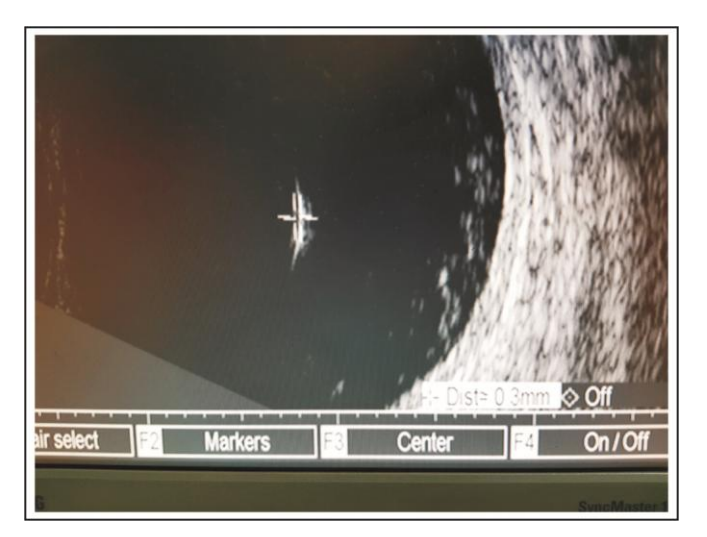
Fig. 2: Ringing bell sign on B – scan. Size of silicone oil bubble is 0.3mm.

This was her third injection in left eye. Her best corrected visual acuity was 20/200 and intraocular pressure was 17 mmHg. She was phakic with no history of ocular surgery apart from intravitreal Bevacizumab. We noted intravitreal silicone oil bubble suspended in superior half of post vitreous cavity but could not capture this finding on fundus camera due to very small and indistinct appearance of this bubble on photography. Her last injection was one month ago. She also remained symptom free.